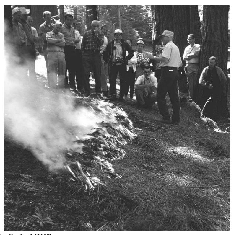
Figure 5. Professor Harold Biswell conducts a demonstration burn in 1969 at Whitaker's Forest, a University of California experimental forest adjacent to Sequoia-Kings Canyon National Parks. Biswell played a major role in how the NPS implemented its new fire management policy in 1968.

Between 1963 and 1967, policy changes to put the recommendations of the NAS and Leopold reports into practice were slow in coming. A number of NPS Washington staff found ways to delay action and maintain the status quo despite what the Leopold Report said (Rothman 2005). When the key NPS fire staff man in Washington heard about the plans at Sequoia–Kings Canyon for allowing natural fires to burn, we understood he replied, "Over my dead body!" (Rothman 2005). But the fires of July 1967 in Glacier raised