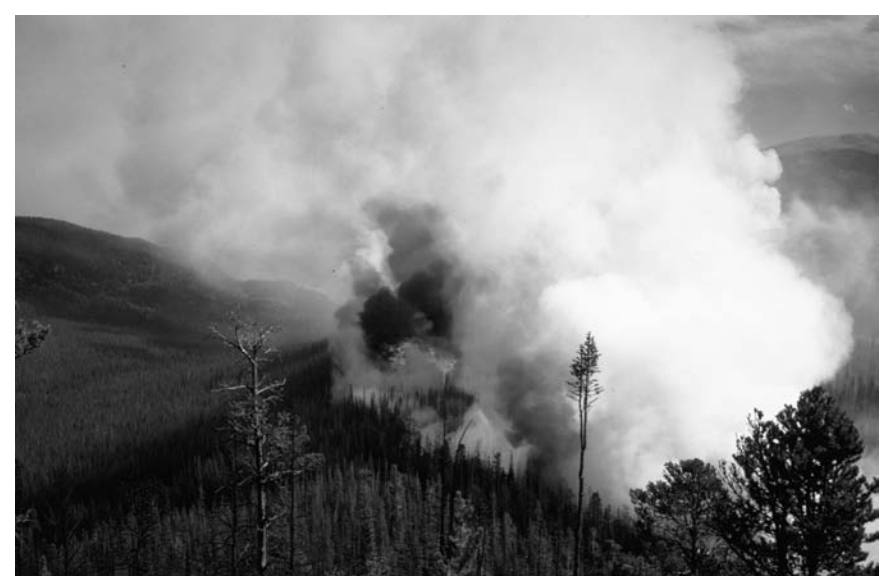
Figure 11. In 1978, the Ouzel Fire at Rocky Mountain National Park, Colorado, was the first PNF to threaten an adjacent community. At first, it crept along the surface, then intermittently crowned. After suppression and a brief stable period, it made a run toward the town of Allenspark. The fire review urged greater emphasis on fire history, adequate prescription criteria, and more consideration of human-ignited prescribed burns.

Fire history, vegetation patterns, fuel loadings, aspect, and drainages where unusual fire behavior may be expected should be emphasized in a natural fire program plan. Fires similar to the