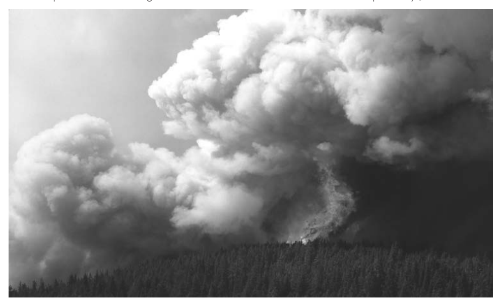
Figure 12. The 1988 fires in Yellowstone provided the first major test of the PNF (WFU) concept and of agency and interagency resolve to support the philosophy of restoring fire to its natural role in parks. High winds caused widespread spotting. Conventional firefighting techniques proved ineffective. There was little public understanding at the time of such a massive fire event.

High winds caused widespread spotting, and "conventional firefighting techniques such as burning to create fuel breaks and backfiring proved ineffective" (Rothman 2007). For the next two months, "everything about the [Yellowstone] fires seemed designed to demonstrate that fire could exceed human control" (Figure 12).