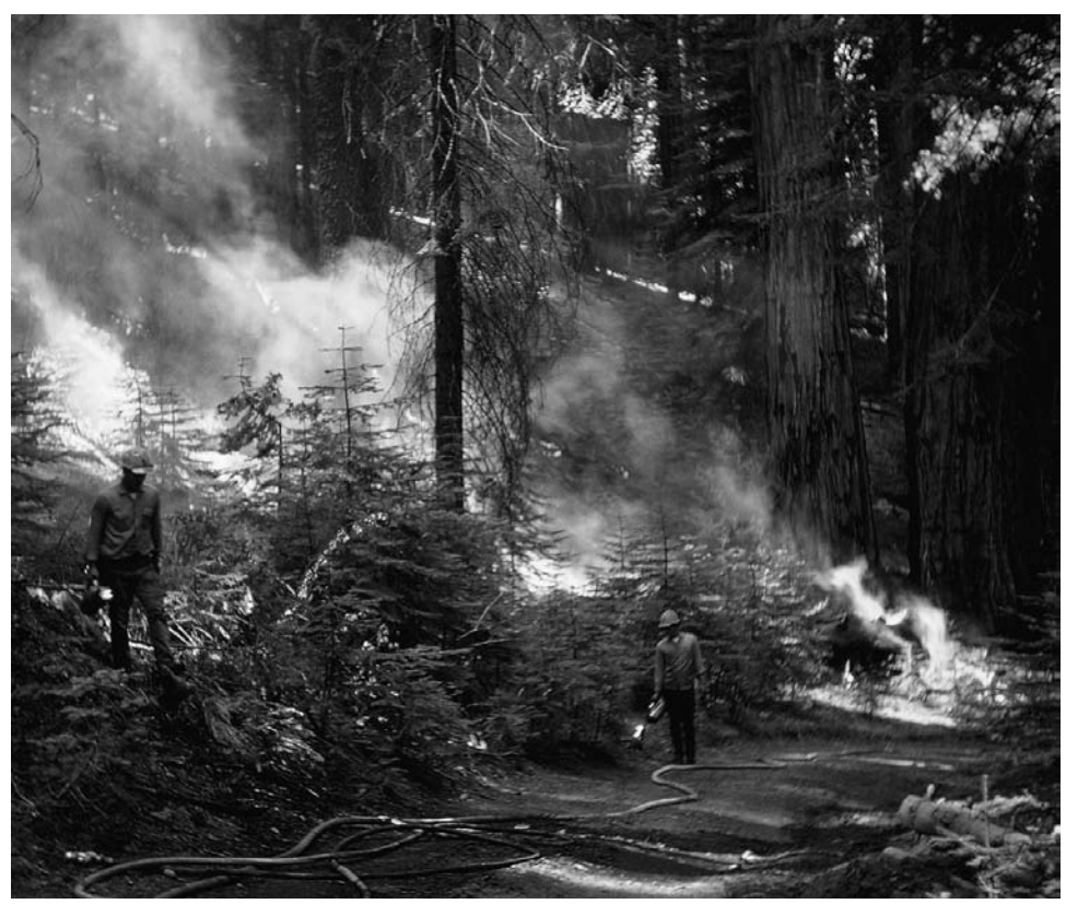
Figure 9. In 1969 at Sequoia-Kings Canyon, compartments roughly 1,000 feet long by 300 feet wide were ignited by drip torches and allowed to burn with the goal of reducing fuels along the Redwood Mountain Grove boundary and gradually restoring fire to its natural role in the sequoia-mixed conifer ecosystem.

allowed to burn more than 27,000 acres, while park staff with drip torches ignited 266 fires that burned over 37,000 acres (Kilgore 1976b).