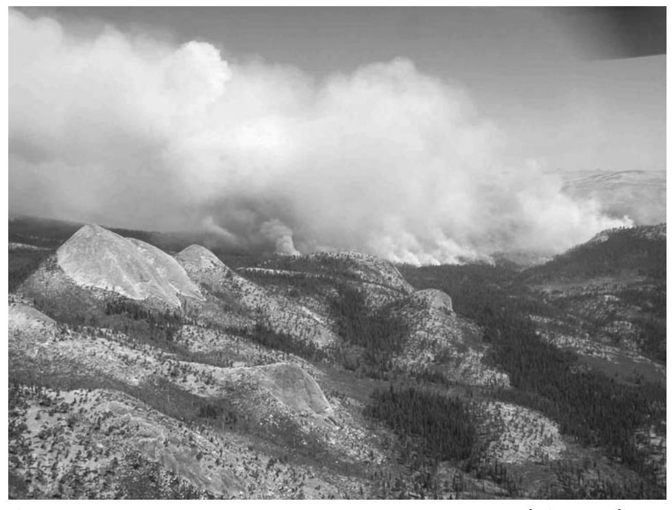
Figure 7. In high-elevation forests at Yosemite, lightning-ignited fires are allowed to burn so long as they pose no threat to human life or property. This 8,000-acre Hoover Fire of 2001 burned at low-to-high severity for several weeks in the same basin as the Starr King fire 27 years earlier. Most burning was of low-to-moderate severity. Some 20 similar WFU fires have burned in this basin over the past 30 years.

In those initial years, we thought of "allowing natural fires to burn" as a clear