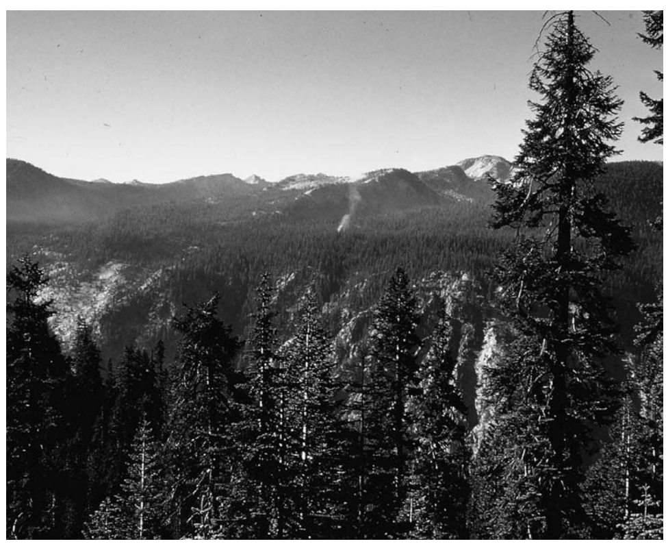
Figure 6. This 1968 Kennedy Ridge fire was the first lightning-ignited fire allowed to burn in any national park in the country. NPS fire policy had been modified in 1967 to allow "fires from natural causes" to burn within predetermined fire management units.

In reviewing some historical documents, I found a 1970 paper of mine that reminded me of the NPS viewpoint at the time (Kilgore 1970). As I presented this paper to a primarily Forest Service audience in Missoula, Montana, I pointed out that I was a researcher with the National Park Service in Sequoia–Kings Canyon. I explained