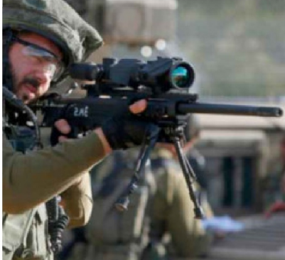
Israeli snipers shot dead starving Palestinians seeking food and water, medical staff, hospital patients, UN staff, reporters, and their families

See https://candobetter.net/end-australias-support-for-genocide(16/3/2024) for PDF and printing instructions. Protest each Sunday from 12pm, Melbourne State Library